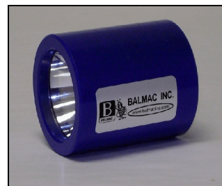
LED Strobe Light Side View